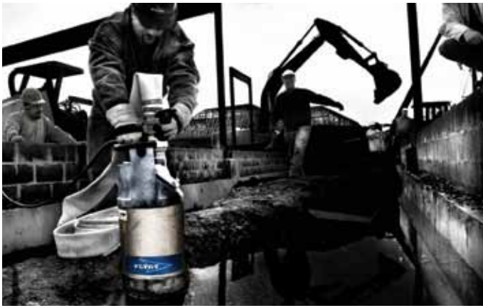
Construction Dewatering Pump